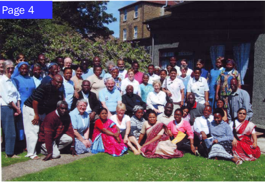
Staff and Summer Course participants 2007

We, too, share Jesus' prophetic office; in him we are prophets and to us he says "As the Father has sent me, so do I send you".